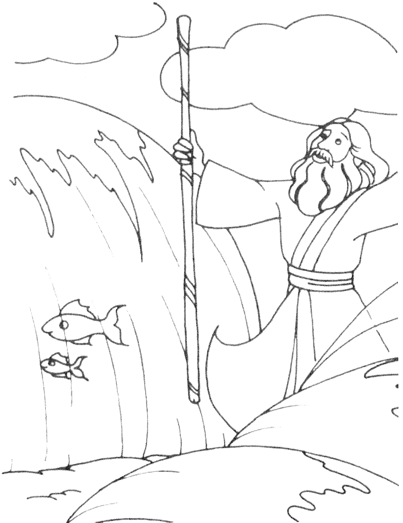
Moses parts the waters